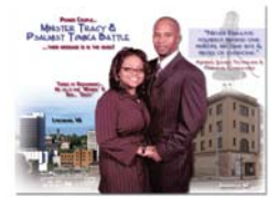
Profile Sample #1

- Format Includes: Annual Web Updates and Posting, Annual Color Reprinting & Precious Docs File Storage